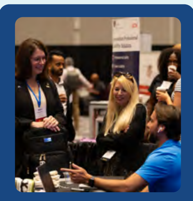
Exhibit Package Includes